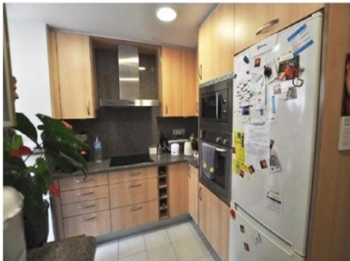
Fully-equipped and elegant kitchen