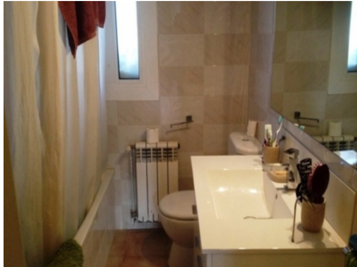
Beautiful bathroom with bathtub