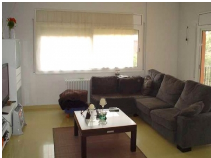
Bright living room