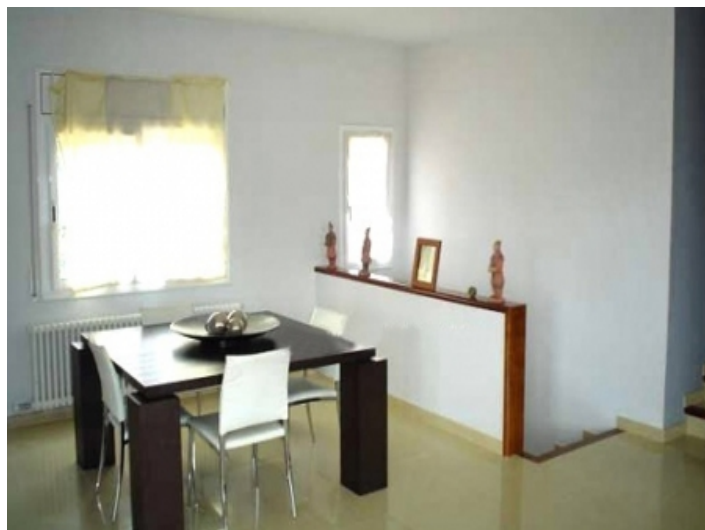
Classy dining room