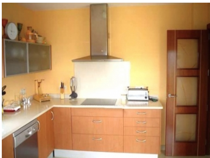
Modern fitted kitchen