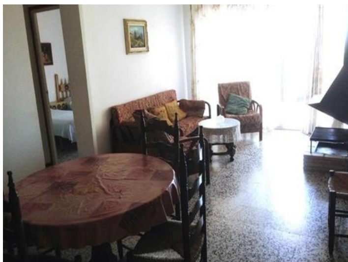
Living room with dining area