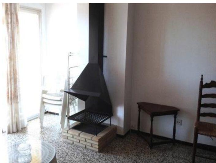
Chimney for the winter