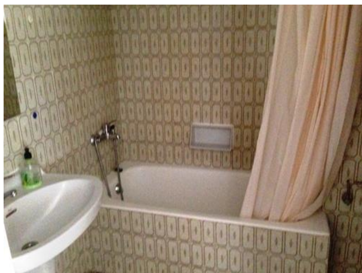
Cozy bathroom with bathtub