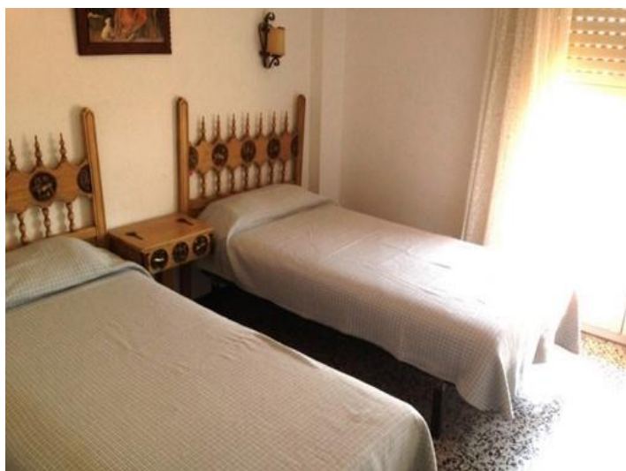
Comfortable double bedroom