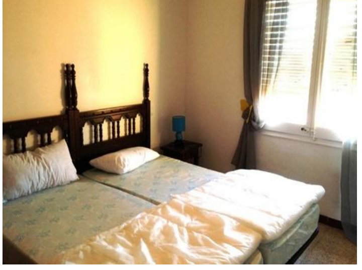
Double bedroom with spanish-styled beds