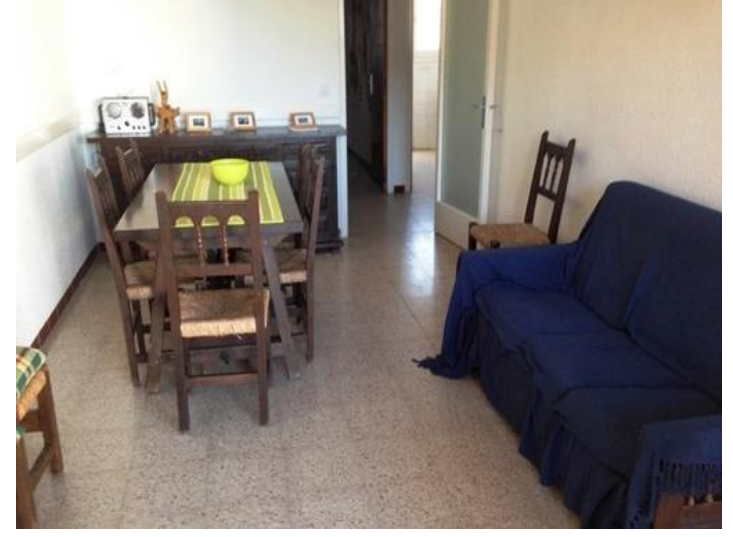
Living room with dining area